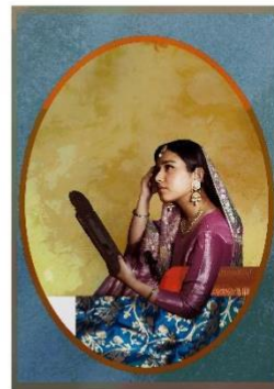
Kangra - 'A princess gazing into a mirror' ca 1866