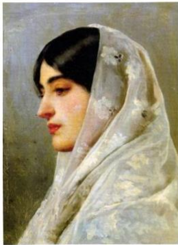
Paquine de Bazo - 'A young beauty' 1882

Description: This work includes a series of paintings from a specific time period (the 1800s) and observes how artists from different regions of the world represented women during that time. I focused upon five different areas; India, Japan, America, Spain and Italy, with varying styles and movements such as impressionism and miniature paintings etc. Upon working on this project I learned some interesting common features between all five paintings; none of the women looked directly at the viewer. There was an effort to accentuate the beauty and delicacy of a woman by either representing her as 'well read' focusing on inner beauty or ornamenting her with jewels gazing into a mirror to reflect 'outer beauty' and so on and so forth.