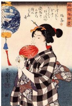
Kuniyoshi Utagawa - 'Woman with fan' c1860s